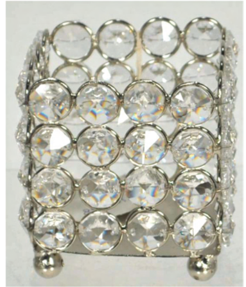
3.5" SQUARE & ROUND VOTIVE HOLDER