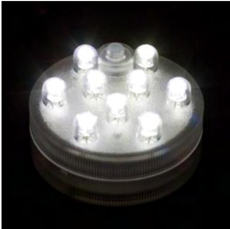
WHITE LED (REMOTE CAPABLE)