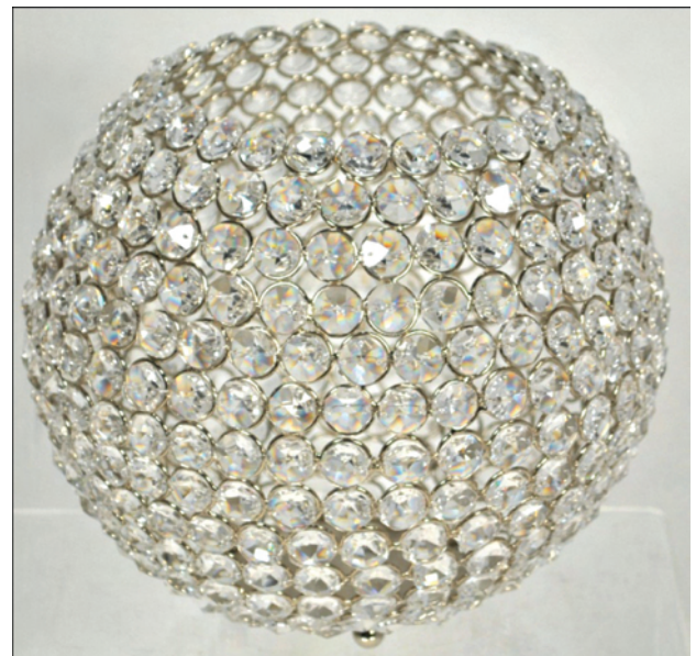
8.5" DIA. CRYSTAL BEADED GLOBE