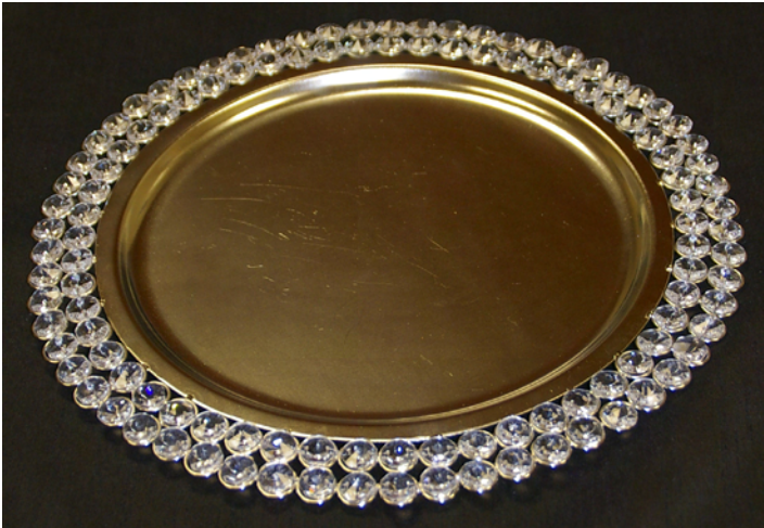
CRYSTAL BEADED CHARGER