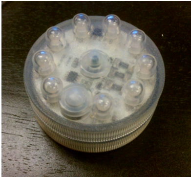
COLOR CHANGING LED (RGB) (REMOTE CAPABLE)