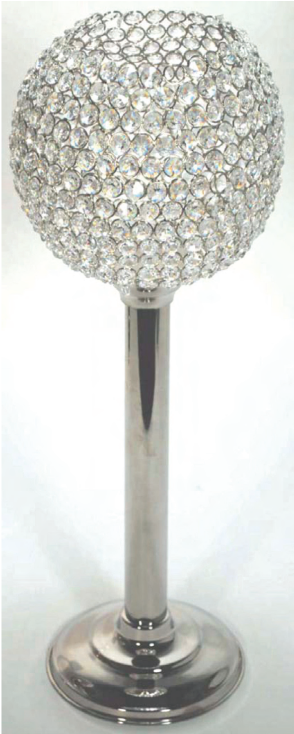
32" TALL x 10" DIA. CRYSTAL BEADED GLOBE